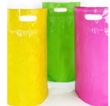
D-cut Type Bag