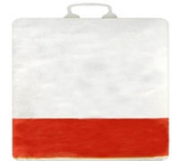
Hanger Type Bag