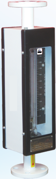
Product Code : MK-G

It is an instrument used to measure instant flow rate of Liquids and Gases. It is installed in the pipe line vertically upward with flanged or screwed connection. Design & Calibration Confirms to ISA - RP16.5 & ISARP16.6