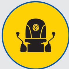
Constant Mesh Side Shift Gear Box