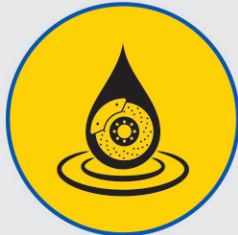
Oil immersed Multi Disc Brakes