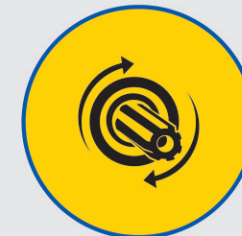
GS P.T.O. / Reverse P.T.O. / Economy P.T.O.

Other Features: Neutral Safety Switch • Front Weight Carrier • Rear Weight • Sliding Seat with bottle holder *(Optional feature) 4WD