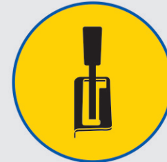
Double Clutch with Independent P.T.O. lever