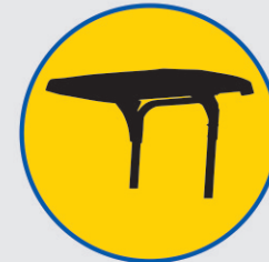
Durable Frame Equipped with Fiber Canopy