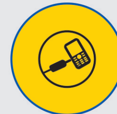
Mobile Charging Point