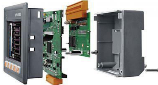
VPD-132/133 series VPD-142/143 series