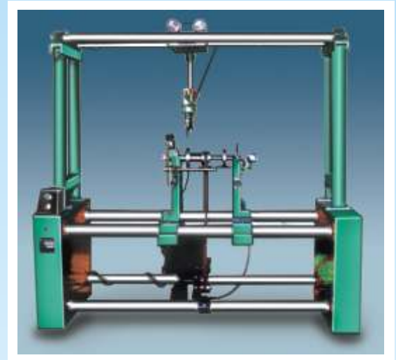
Machine provided with optional vertical drilling attachment.

The machines features a very simple operation. The working cycle is fully automatic. From safety point of view a double press push button starts machine, measures and stores the unbalance values on DPMs for two plane simultaneously and stops machine. Key board facility provided in measuring panel for correct data feeding of rotor with 1 digit accuracy for its dimensions like A, B, C, R1 & R2. Tolerance limits of both correction planes i.e. +11 & +12 can be feed so that when rotor is balanced within the limits respective LEDs glow up, indicating no further correction necessary. For other details please refer "features of measuring panel HDCM-8500".