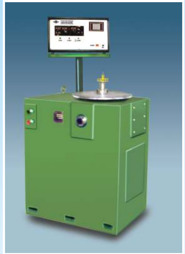
Vertical Single Plane

Both type of machines are provided with electronic companion software to compensate the unbalance effect due eccentricity between rotating (Spindle) axis & adaptor (Rotor) axis.