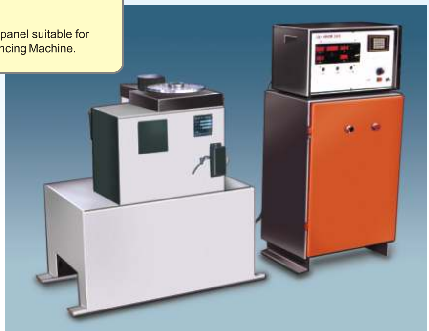
Vertical Single Plane or Two Plane

This is a microprocessor based measuring panel suitable for FIE Vertical Single Plane Hard Bearing Balancing Machine.