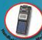
Handheld Ticketing Machine