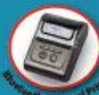
Receipt Thermal Printer