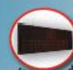
LED Display Board

MANUFACTURED BY NGX Technologies Pvt.Ltd., Bangalore, Karnataka www.ngxtechnologies.com