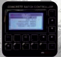
Black and white Controller