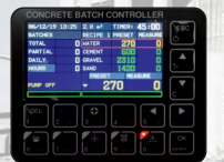
Colour Display Controller (Optional)