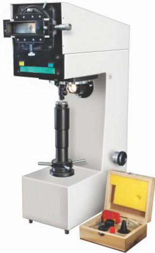
Model : VM 50