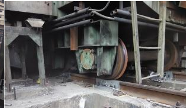
Coke Oven Charging Car Weighing System at JSW Thornagallu