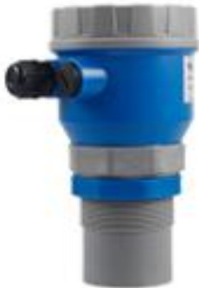
UEM 3000 Series Integrated & Separate Indicator Ultrasonic Level Sensors