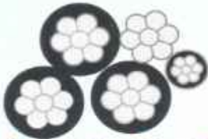
Cross sectional view of Aerial Bunch Cables