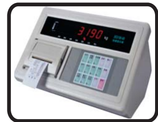
Built-in Printer Indicator