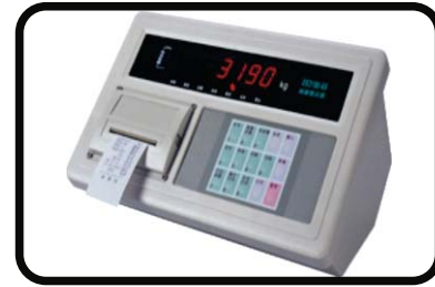
Built-in Printer Indicator