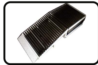
A Type Platform Rollers & Ramps