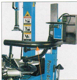
Helper Arm for RFT