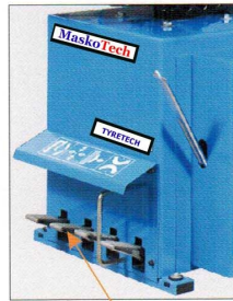
Arm Tilting Pedal