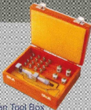
■ Wooden Tool Box